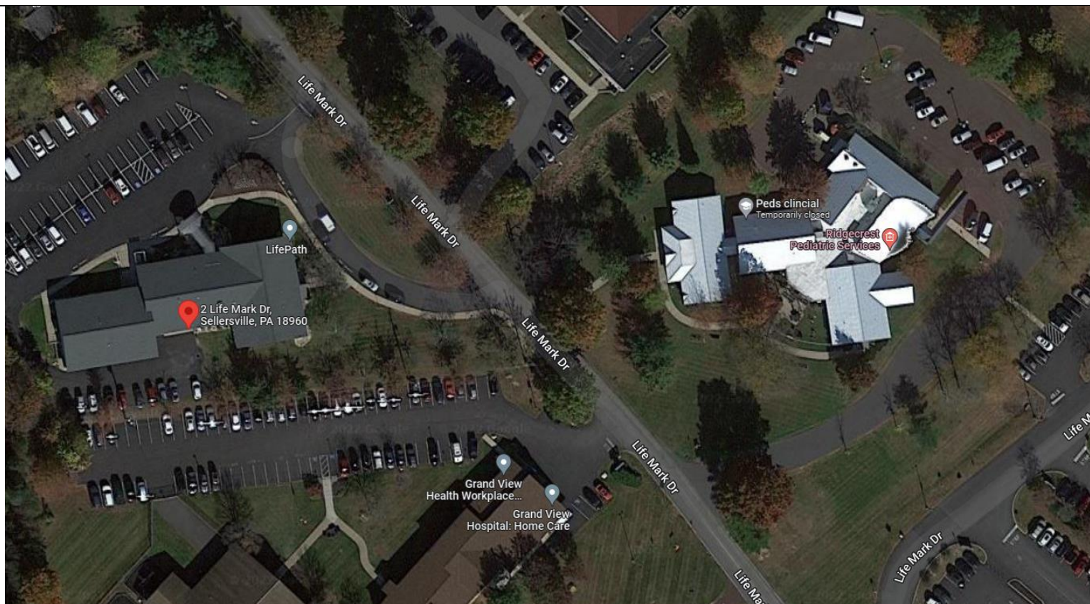
View of Ridgecrest Pediatric Services Intermediate Care Facility (ICF) in close proximity to LifePath: