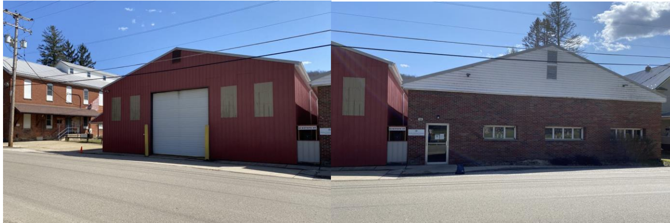
State Hospital across the street:

This service location had an onsite visit that confirmed the service location is across the street from the Warren State Hospital but there is no connection between the two places. The service location does not isolate the individuals who attend the CPS program from the broader community. Down the road from Dr. Gertrude A Barber's service location is a suburban neighborhood with many local shops and restaurants. Some of these places include: Jones Pest Control, North Warren VFD Station 55, North Warren Presbyterian Church, Train Station Restaurant, Bob Evans, etc.